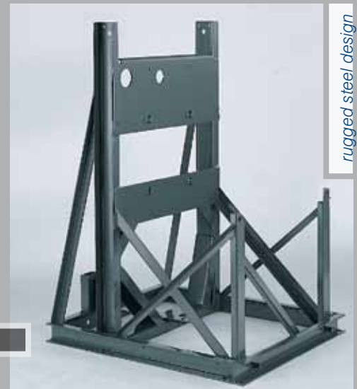
rugged steel design